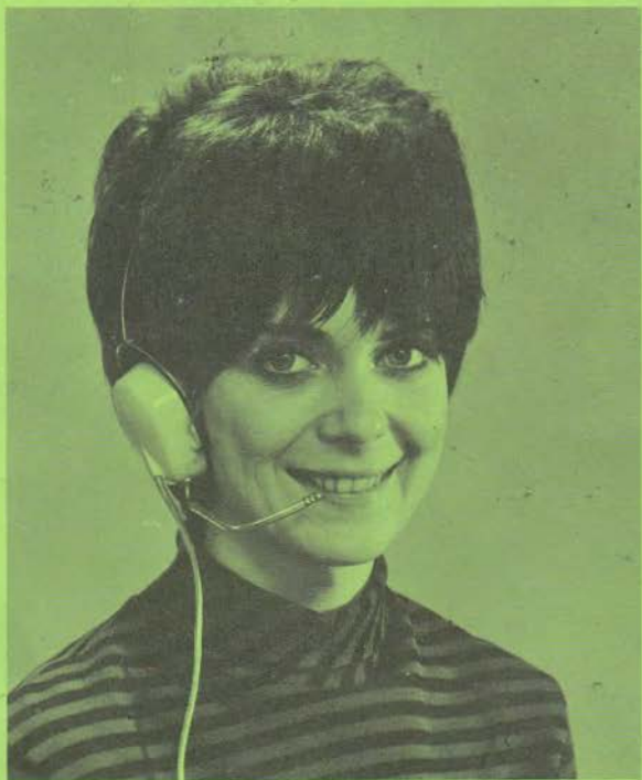
60A (Headband) HEAD TELEPHONE SET