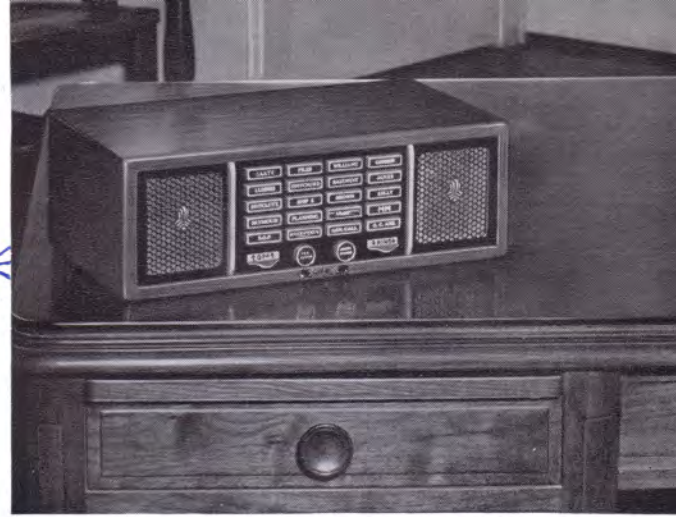
"NAME TOUCH" EXECUTIVE STATION

This typical Select-O-Phone layout illustrates but one of countless variations possible. The system—to exactly meet a current need—can be quickly and economically expanded as needed to an ultimate capacity of 36 lines.