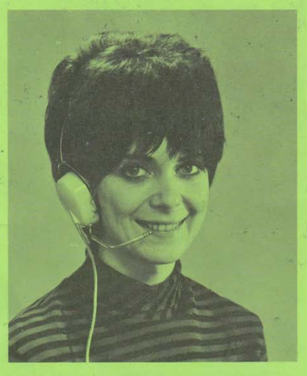
60A (Headband) HEAD TELEPHONE SET