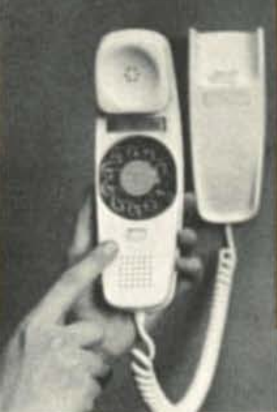
is a recall button. You will find it

You can adjust the ringer volume. For a softer or louder ring, simply move the control located on the bottom of the desk model or on the side of a wall-mounted TRIMLINE phone.