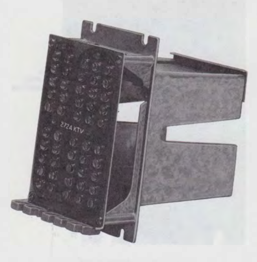
Fig. 1-272A KTU, Rear View