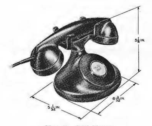
FIG. 1-215 TYPE

This section covers the combination of apparatus, circuit diagram, and connections for the 215-type hand telephone sets for magneto service.