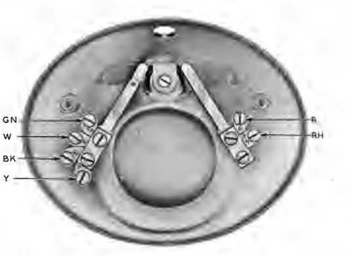
FIG. 3-D8-3 HANDSET MOUNTING