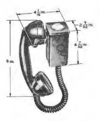
FIG. 1-211 TYPE

This section covers the combination of apparatus, circuit diagram, and connections for the 211-type hand telephone sets for magneto service.