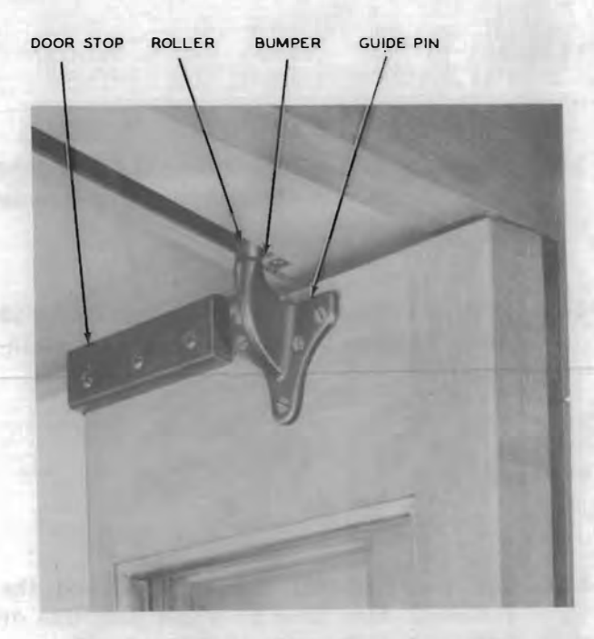
Fig. 1 – 11-Type, Upper Door Assembly