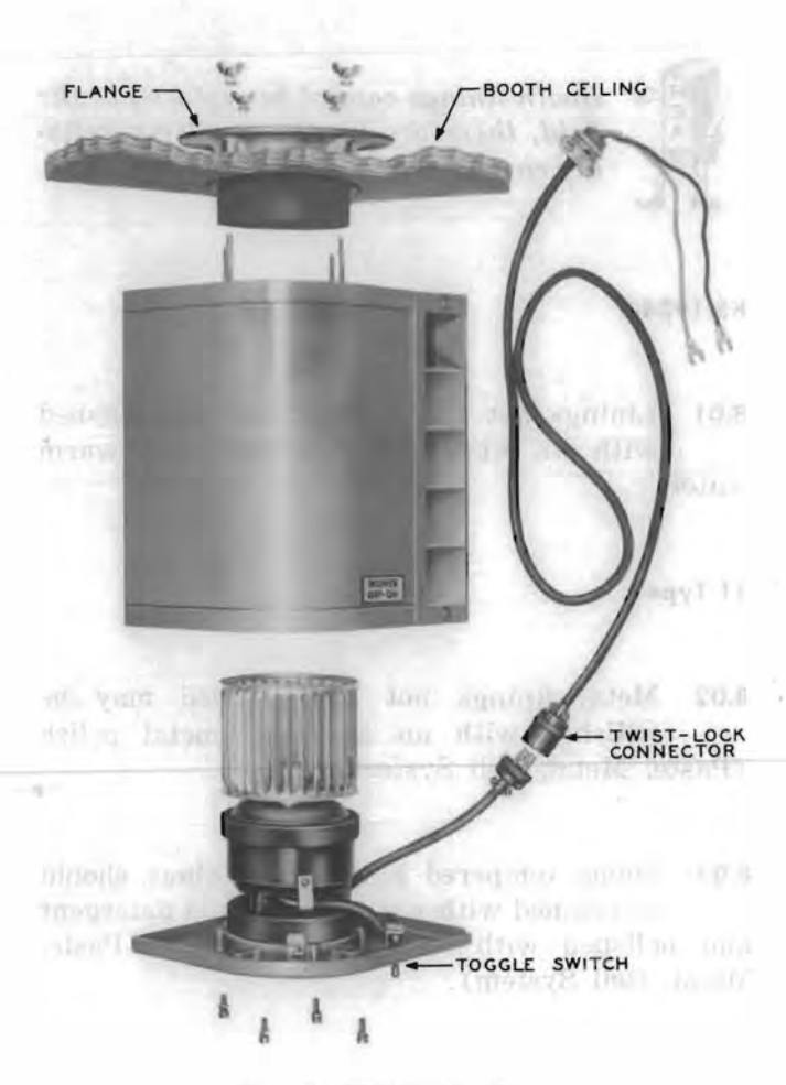
Fig. 3 - KS-14125 Blower

(1) Using KS-8187 wrench, remove the four screws which secure the cover at the bottom